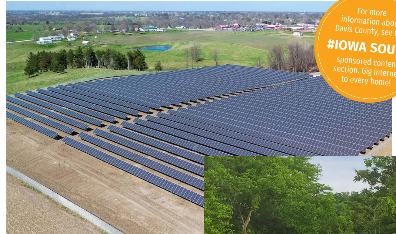
Energy independence and recreation go hand in hand in Davis County.

A new 5-kilometer wheelchair-accessible trail connects Bloomfield City Park and walk-in swimming pool to the Mutchler Community Center with its indoor track, gymnasium and weight training and